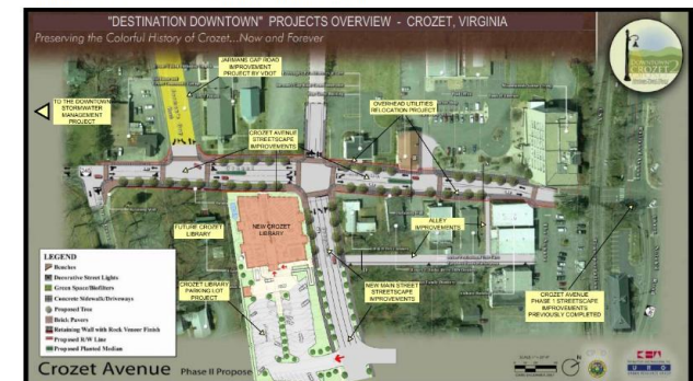
Destination Downtown: Crozet Streetscape Project, Sidewalks, Stormwater

Crozet is a very desirable community with a growing residential population and expanding businesses, schools, recreation facilities and cultural offerings. Crozet's downtown area has been a vital part of the community since its inception. The Crozet community is committed to downtown as the focal point and community center of Crozet, and the streetscape project and other downtown enhancements will help foster economic vitality as well as preserve and accentuate the historic character of Downtown Crozet. The first phase of this project has been completed and included the installation of a new stormwater drainage system at the Three Notch Road (Rte 240)/Crozet Avenue intersection extending northward along Crozet Avenue. It also encompassed the pedestrian and streetscape enhancements at the intersection extending through the railroad overpass to the "Square". The Crozet new library was constructed nearby and includes a 100-space parking lot, and improved road networks along the rear alley way and the beginning section of Library Avenue.