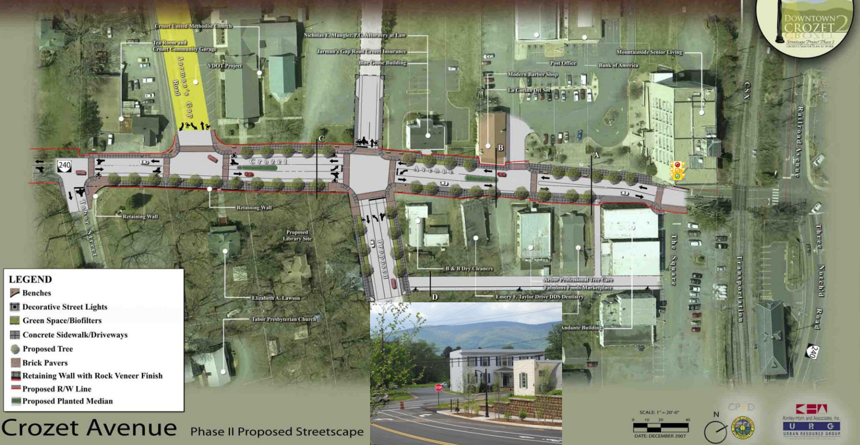
Crozet Avenue Phase II Proposed Streetscape

Preserving the Colorful History of Crozet...Now and Forever