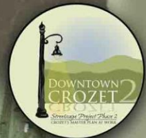
Crozet Avenue Phase II Proposed Streetscape